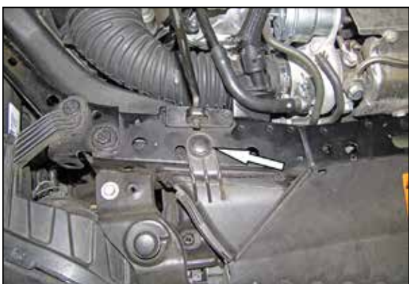
2. Remove the retaining pin the secures the fresh air intake duct.

1. Turn off the ignition and disconnect the negative battery cable. NOTE: Disconnecting the negative battery cable erases pre-programmed electronic memories. Write down all memory settings before disconnecting the negative battery cable. Some radios will require an anti-theft code to be entered after the battery is reconnected. The anti-theft code is typically supplied with your owner's manual. In the event your vehicles anti-theft code cannot be recovered, contact an authorized dealership to obtain your vehicles anti-theft code.