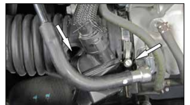
5. Disconnect the crank case vent chamber from the factory intake tube. Loosen the hose clamp that secures the intake tube to the turbo inlet.