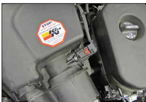
4. Disconnect the mass air sensor electrical connection.