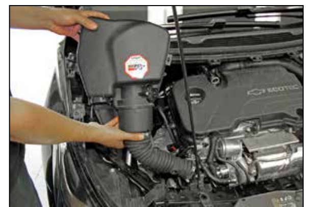
6. Lift up and remove the complete stock intake system from the vehicle. NOTE: K&N Engineering, Inc., recommends that customers do not discard factory air intake.