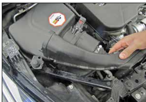
3. Lift up the fresh air intake duct to dislodge it from the factory air filter housing and then remove it from the vehicle.