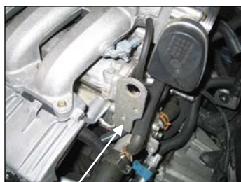
Fig. # 5