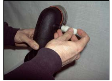
Fig. # 12