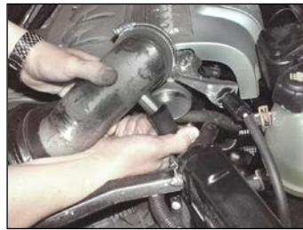
Fig. # 14