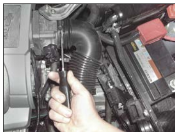
Fig. # 1

WARNING: Before starting the engine carry out a final fitment check of the K&N performance kit. It will be necessary for all intake systems to be checked periodically for realignment, clearance and tightening of all connections. Failure to follow the above instructions or proper maintenance may void the warranty.