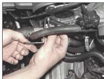
Fig. # 6