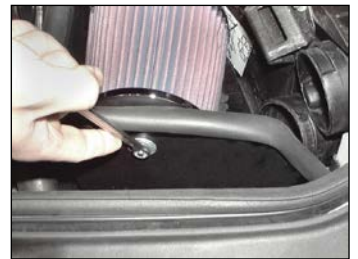
Fig. # 16