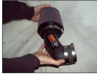
Fig. # 11