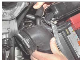
Fig. # 2