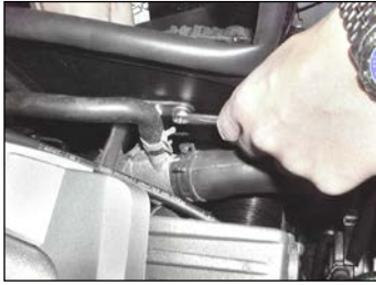
Fig. # 9

Renault Clio 172 2.0L 16v 172bhp Jan'00-Apr'01