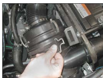
Fig. # 3