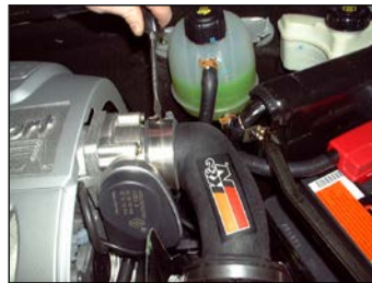
Fig. # 15