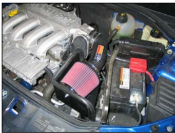
Fig. # 17