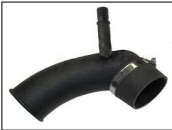
Fig. # 13