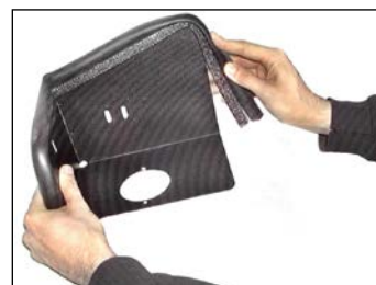
Fig. # 8