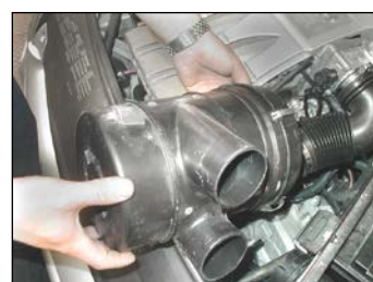
Fig. # 4