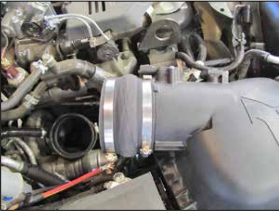
10. Install coupling hose (08695) onto air box assembly. Secure with provided hose clamp.