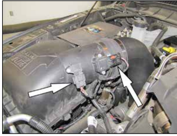
12. Reconnect the mass air sensor and temperature sensor electrical connections.