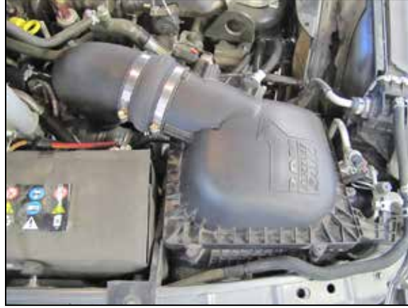
13. Reconnect the vehicle's negative battery cable. Double check to make sure everything is tight and properly positioned before starting the vehicle.

14. The C.A.R.B. exemption sticker, (attached), must be visible under the hood so that an emissions inspector can see it when the vehicle is required to be tested for emissions. California requires testing every two years, other states may vary.