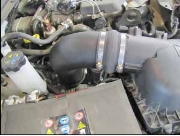
11. Install K&N® intake tube into the factory turbo inlet hose and then into coupling hose (08695). Secure K&N® intake tube with provided hose clamps.