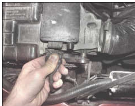
Fig. # 1

For cleaning instructions please visit our website: www.knfilters.com/cleaning