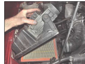
Fig. # 4