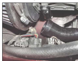
Fig. # 14