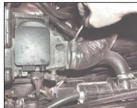
Fig. # 2