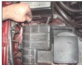
Fig. # 3