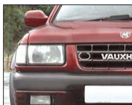
Fig. # 15