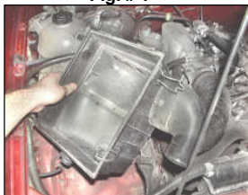
Fig. # 5