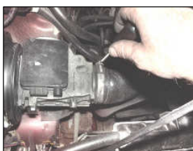
Fig. # 13