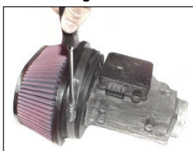
Fig. # 9