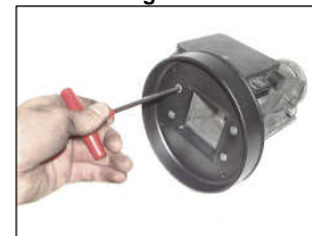
Fig. # 8