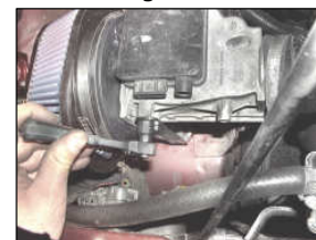
Fig. # 12