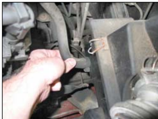
Fig. # 1

WARNING: Before starting the engine carry out a final fitment check of the K&N performance kit. It will be necessary for all intake systems to be checked periodically for realignment, clearance and tightening of all connections. Failure to follow the above instructions or proper maintenance may void the warranty.