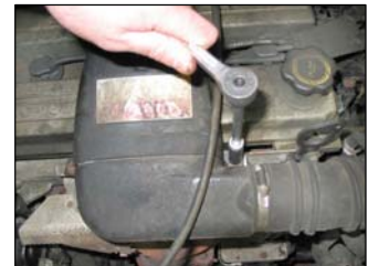
Fig. # 4