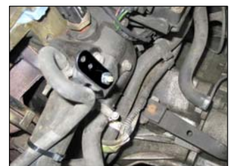
Fig. # 12