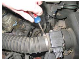
Fig. # 2