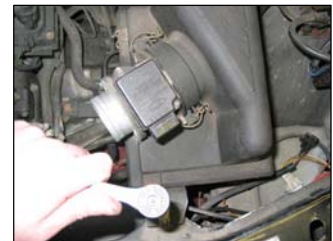
Fig. # 8