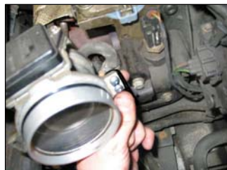
Fig. # 13

Ford Fiesta 1.6L & 1.8L 16v Zetec 1992-95