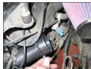
Fig. # 20