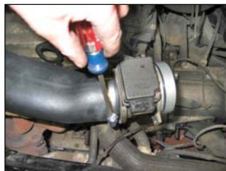
Fig. # 15