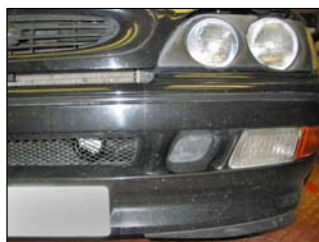
Fig. # 19