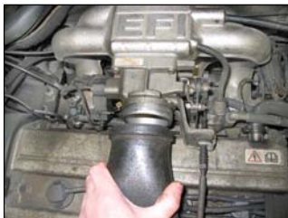
Fig. # 5