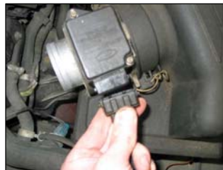
Fig. # 7