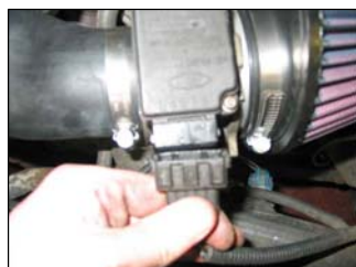
Fig. # 17