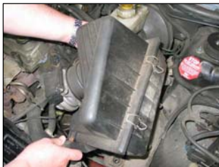
Fig. # 9