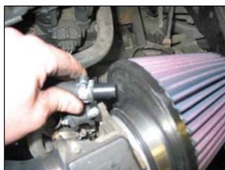
Fig. # 18