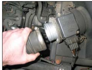
Fig. # 3