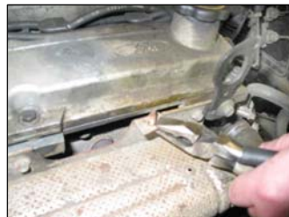
Fig. # 6