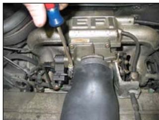
Fig. # 14