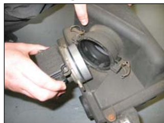
Fig. # 10